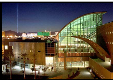
The UNLV Lied Library is a popular late-night locale for both students and faculty who need to study or conduct research after a long day of classes.

The primary goal of the campus shuttle service has always been to provide members of the campus community with an additional sense of security and safety at night. The shuttle service takes people on pre-determined routes from various inner-campus shuttle stop locations to UNLV's parking lots. Anyone interested in information regarding shuttle stop locations, shuttle routes and hours of operation can call Parking Services at 895-1300.